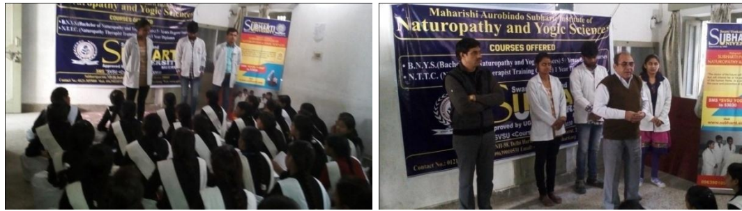
Yoga Workshop at Rastriya Inter College, Noornagar, Meerut