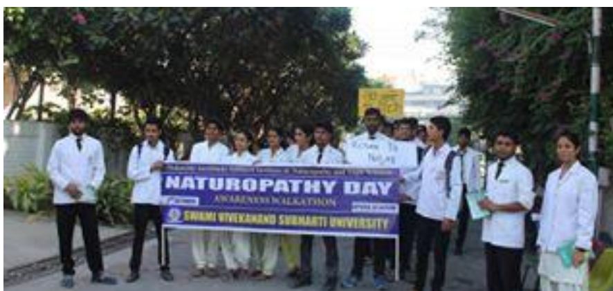
Our students celebrated Naturopathy Day on 2 nd October 2015