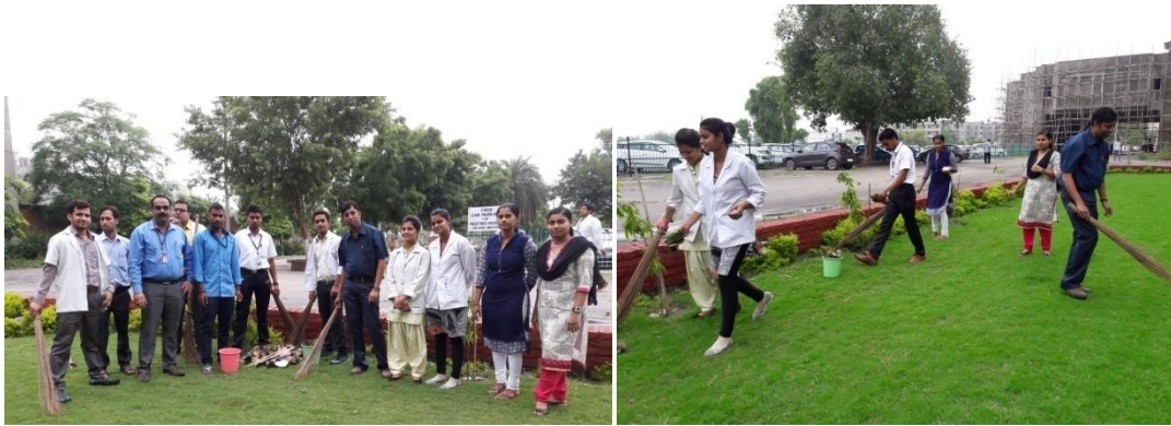
Our College Doctors, Interns & Students participated with great enthusiasm on the occasion of "SWACHHATA DIWAS" on 01-07-2016