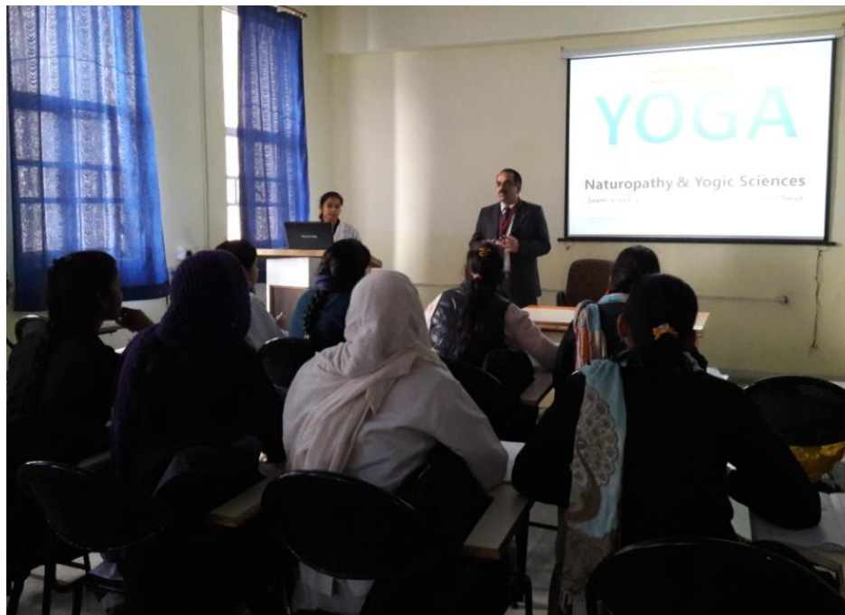
An orientation program & workshop on Yoga