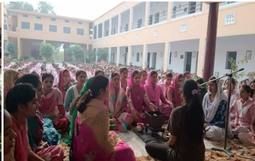
Naturopathy & Yoga awareness cum treatment camp at Adarsh Kanya Inter College, Mawana