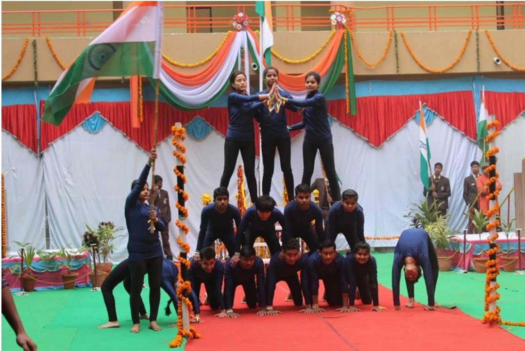
Yoga Trials for Inter-University Sports participation at SITE campus