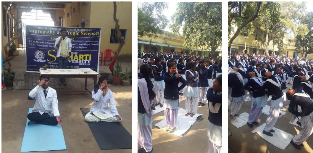
Yoga Workshop at Krishi Inter College, Jaisinghpur (Mawana)