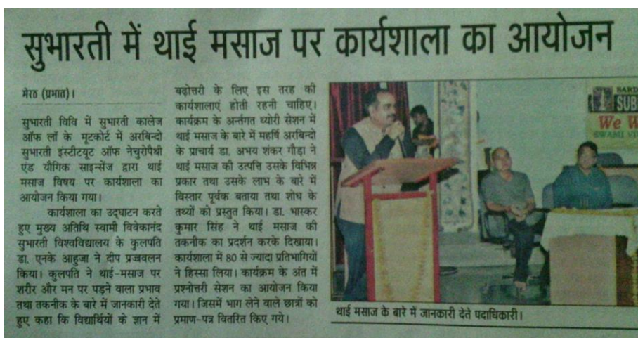
One Day Workshop on Thai Massage on 27/09/2015 - 82 participants attended the Workshop.