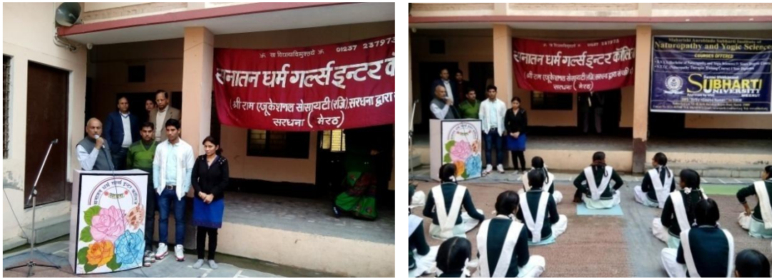
Yoga Workshop at 22.12.2015 at SD Kanya Inter College, Sardhana