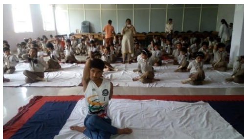
Yoga Workshop at Aatman Public School, Rohta Road, Meerut