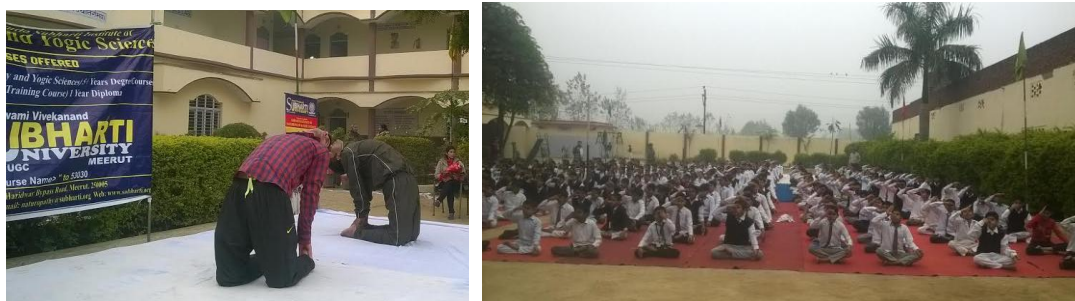
Yoga Workshop at Sri Dewan Singh Public School, Titawi, Muzaffar Nagar