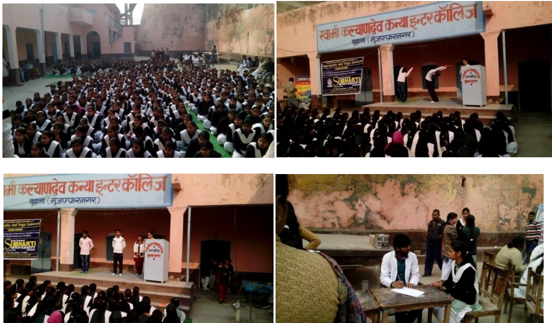
Yoga Workshop at Kalyan Dev Kanya Inter College, Budhana