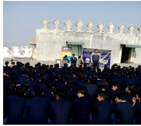
Yoga Workshop at Vidhya Mandir Inter College, K-Block, Meerut