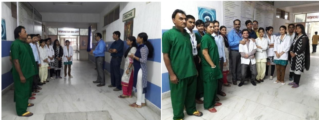
Our college celebrated Doctors Day in the OPD on 01-07-2016