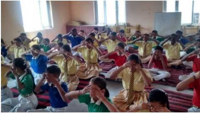
Yoga Workshop at Lady Asharfi International School, Sardhana Road, Meerut