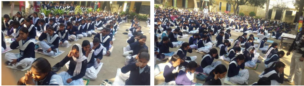
Yoga Workshop at Nehru Smarak Inter College, Matour (Mawana)