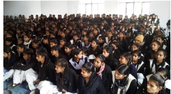
Yoga Workshop at Rajakiya Kanya Inter College, Madhavapuram, Meerut