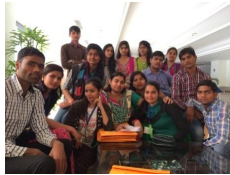
Twenty one students of our college attended the International Conference on Yoga and Holistic Health 2016 held in Haridwar