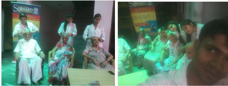
Naturopathy & Yoga awareness camp and provided free consultations to elderly residents of Maa Aanandamayi Vriddh Ashram (Old age Home), Delhi Road, Sain Puram, Meerut