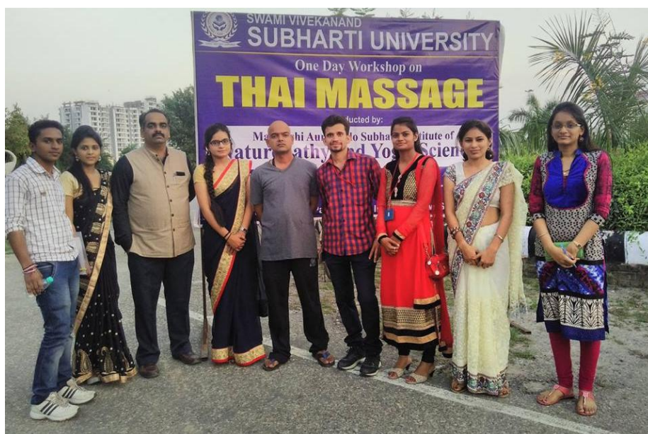
One Day Workshop on Thai Massage on 27/09/2015 - 82 participants attended the Workshop.